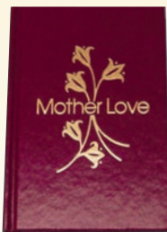
Mother Love Prayer Book $15.00* *Plus S&H

Check the links on www.capuchin.com or www.fatherangelus.com ; Christian Mother's new website links